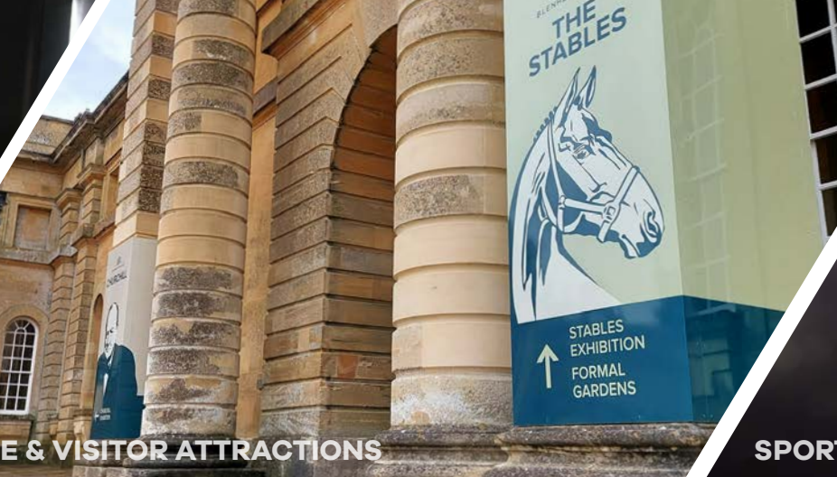
HERITAGE & VISITOR ATTRACTIONS