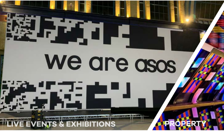
LIVE EVENTS & EXHIBITIONS

We deliver innovative solutions across a range of sectors including live events, retail, sport, property, heritage and visitor attractions.